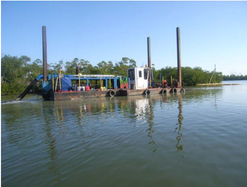
Saturday, December 20, 2008 Dredge "Michael" working in Roosevelt Channel