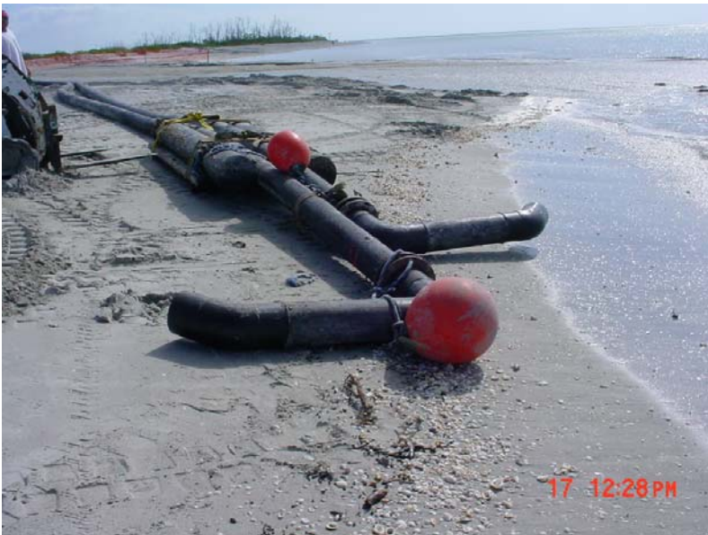
Wednesday, December 17, 2008 90° Elbows Used For Placing The Nearshore Material.