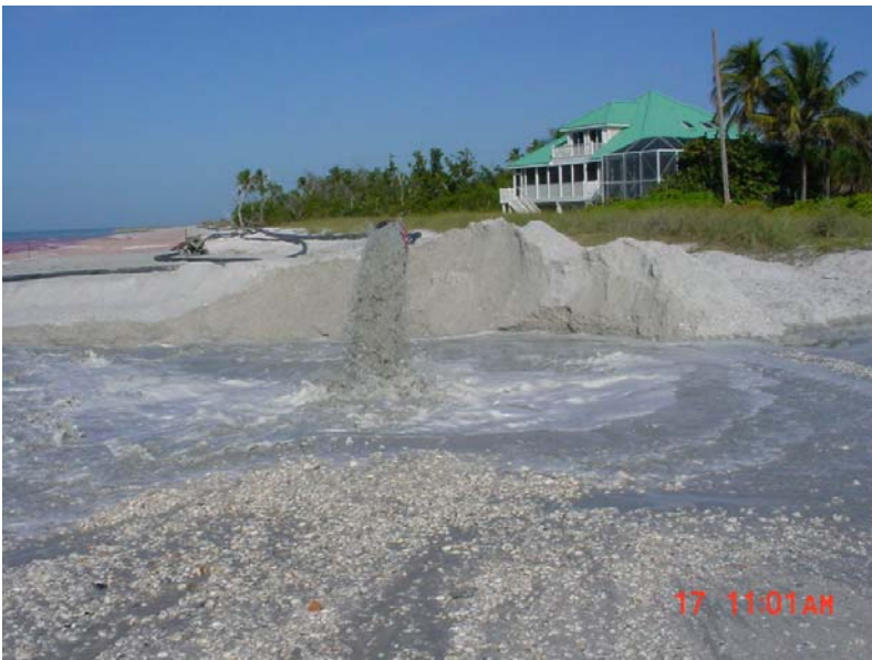
Wednesday, December 17, 2008 Beach Placement Operations