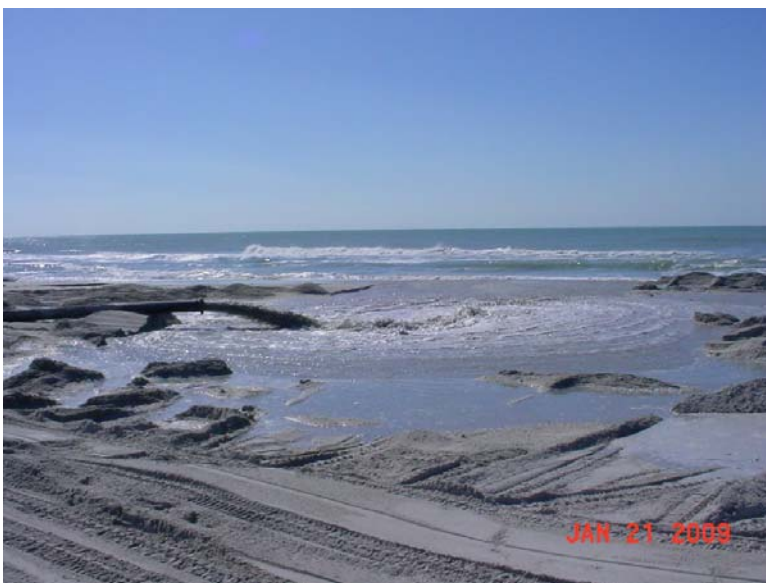
Wednesday, January 21, 2009 Sand Placement for the Beach Compatible Material