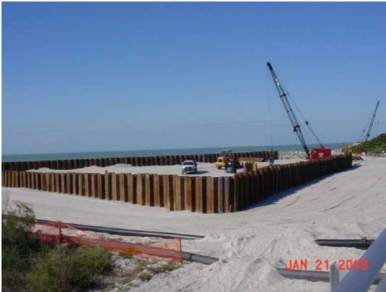
Wednesday, January 21, 2009 The Containment Cell Located seaward of Blind Pass Bridge