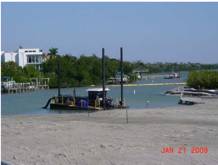
Wednesday, January 21, 2009 Dredge Nate Working Towards Blind Pass Bridge