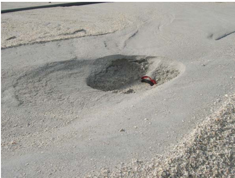
Friday, December 12, 2008 View of Dredged Material on Beach