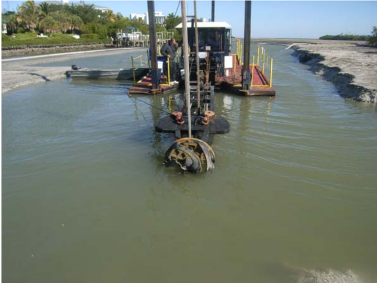
Saturday, December 13, 2008 View of Cutterhead on Dredge "Nate".