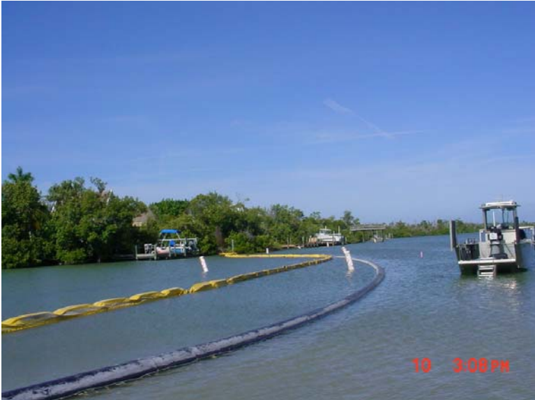
Wednesday, December 10, 2008 Turbidity Curtains in Place Around Dredge Area