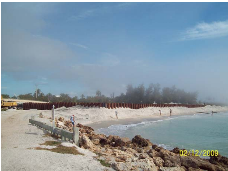
Thursday, February 12, 2009 View of Containment Cell