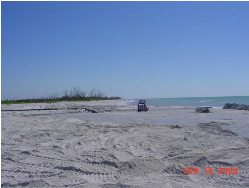
Monday, February 16, 2009 Beach Fill Operations