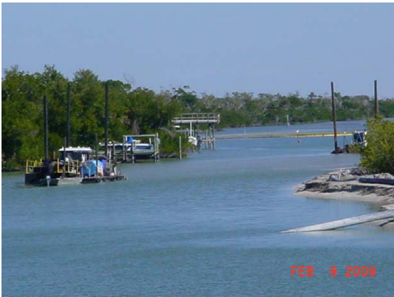
Monday, February 09, 2009 Dredging Operations in Wulfert Channel